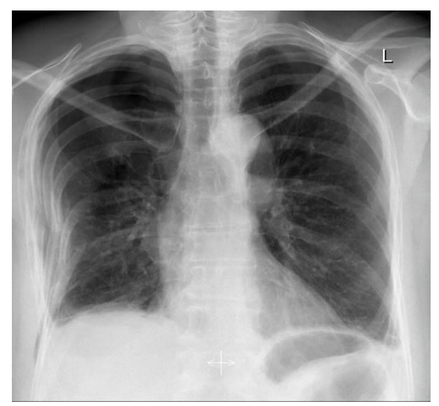
Figure 3: Plain chest X ray postro-anterior view showing multiple fracture ribs on the right side causing a right lateral flail segment

In the present study, it was found that age had no significant correlation with the cause of flail chest trauma, while Albaugh et al., (2000)found that age is the strongest predictor of flail chest trauma outcome