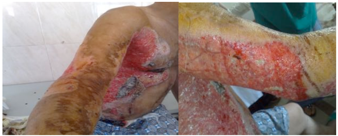
Figure (4): 45y old male with accidental third degree electrical burn involving right side of the trunk, right arm and right forearm at his work place in Al-Mehala textile factory.

Figure (3): 18 months old male child with accidental deep second degree scald by hot water affecting front of chest, left arm and face.