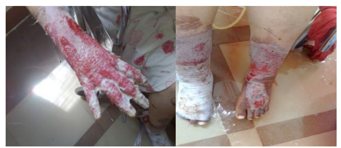
Figure (2): Female patient aged 18y with accidental flame burn at home while cooking in her face (second degree) and in hands, wrists, forearms and legs below knee joints (third degree).