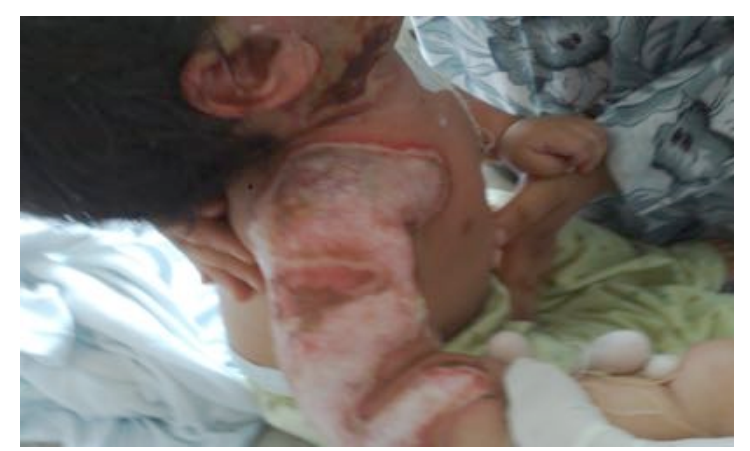
Figure (3): 18 months old male child with accidental deep second degree scald by hot water affecting front of chest, left arm and face.