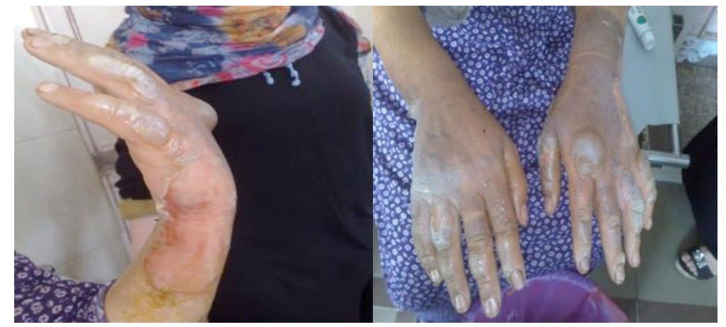
Figure (1): 51y old female with accidental deep second degree flame burn in both hands and wrists. Cause was explosion of a gas cylinder at home.